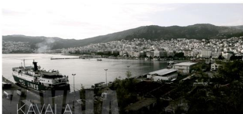
KAVALA An amphitheatre to the Aegean Sea...