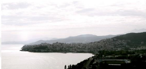
VARNA The Sea Capital of Bulgaria...