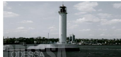
ODESSA The center of trade and commerce, of art and culture...