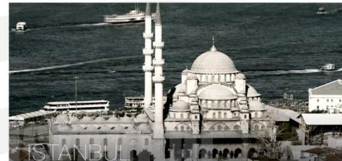
ISTANBUL An enchanting blend of Eastern and Western culture...