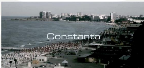
CONSTANTA The oldest port of the Black Sea, the fourth largest port in Europe...

The new Institution "Cultural Ports of the Black Sea" aims to contribute to the development of cultural tourism in the Black Sea region and to promote the cultural role of the port cities. It will be a timeless institution which would promote the friendship, good relations and cooperation in the fields of culture and tourism among the port cities of the Black Sea and will contribute to the wider urban and regional development efforts in the region.