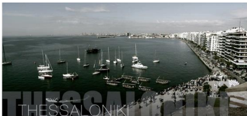
THESSALONIKI The city with the longest urban waterfront...