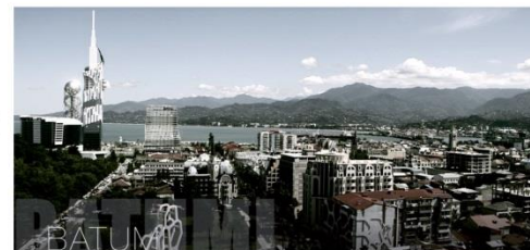
BATUMI Georgia's popular, summer capital...